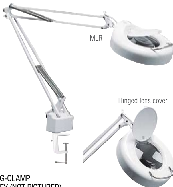
Hinged lens cover