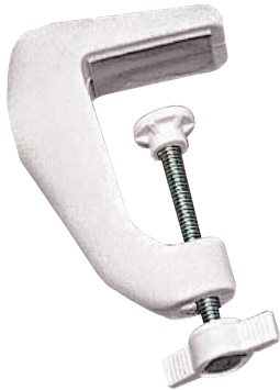
Plain G-Clamp for clamping onto horizontal surfaces only (white only)