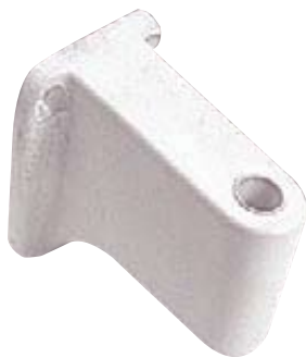
Extra heavy duty wall bracket (white only)