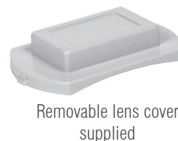
Removable lens cover supplied