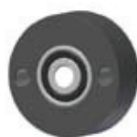
Moving parts of lifting mechanism fitted with bearings for extra durability