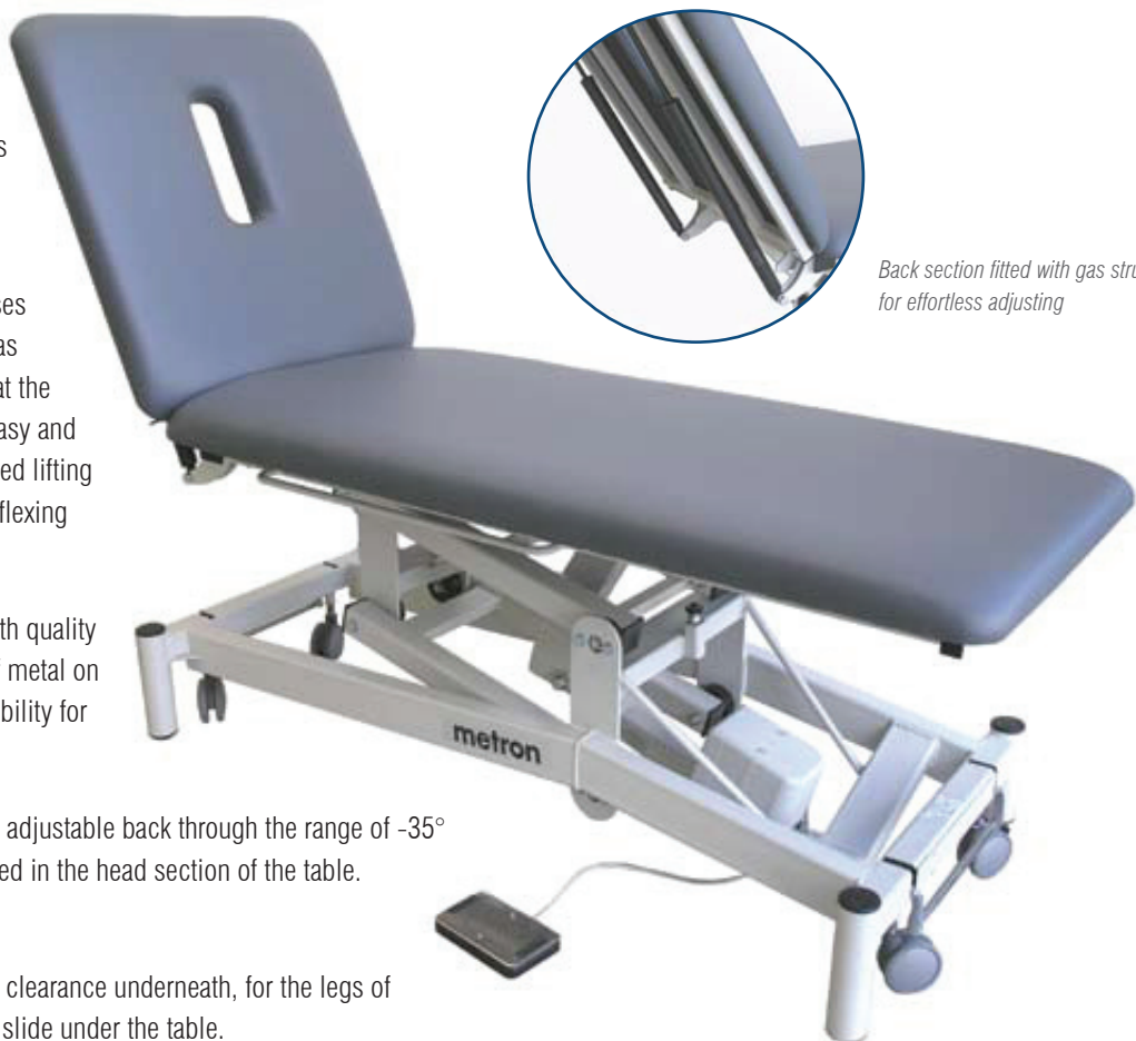
Back section fitted with gas struts for effortless adjusting

The base of the table allows extra clearance underneath, for the legs of a patient hoist or lifting device to slide under the table.