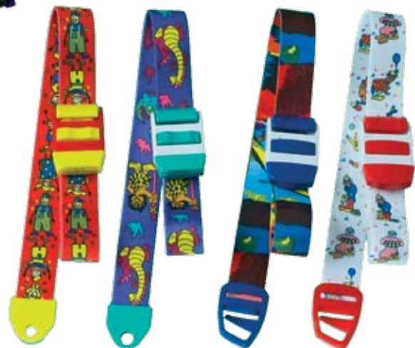
K5087 K5085 K5020 K5086