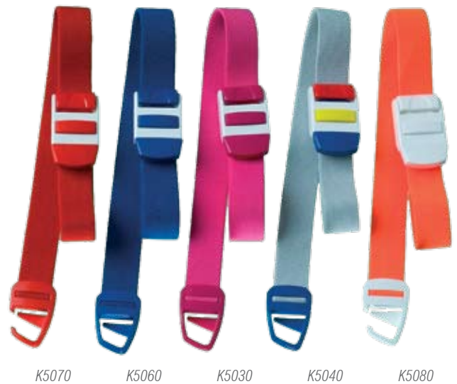
K5070 K5060 K5030 K5040 K5080