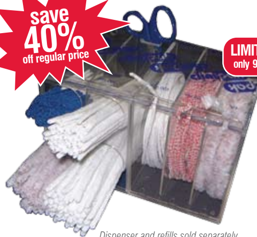
Dispenser and refills sold separately