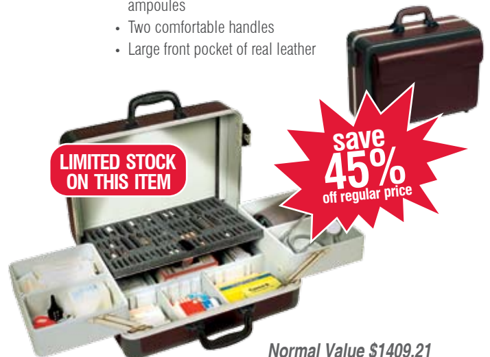
Bollmann Progress sample image only Contents not included